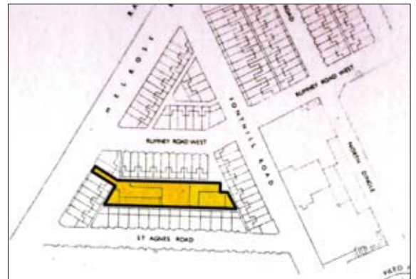
Not to scale. For identification purposes only