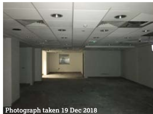
Photograph taken 19 Dec 2018

A town centre retail investment with a current rent reserved of £42,000pa and with the potential to redevelop the upper floors subject to the necessary planning permission to achieve an income of circa £75/80,000pa . The property comprises a substantial three storey building arranged as two ground floor retail units together with office/ancillary accommodation to the upper floors. One unit is currently occupied by 'Vina Nails & Beauty' by way of a 10 year-lease commencing March 2021 producing £12,000pa. The larger unit is let from November 2019 at a rent of £30,000pa, however the tenant is not in occupation. The upper floors would be suitable for re-development to include 14 lettings rooms or alternatively 6 self-contained flats and there is also potential to add floor space by extending to the rear, subject to obtaining the necessary planning consents.