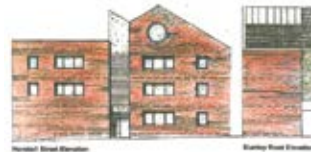
Land adjacent to 61 Harebell Street, Liverpool L5 7RL. Illustrative proposal for 5 one bedroom flats.